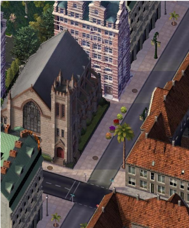
Support facilities for the base include shops, restaurants, and the Panfelinic Chapel, open to all felines at all hours, day or night.