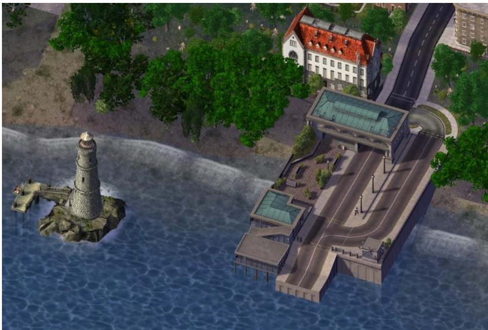
Westport handles all traffic from Coco Landing and all points upriver. It is secured by a joint task force of the Office of Internal Security and the Tactical Response Team from the 163 rd Regiment.