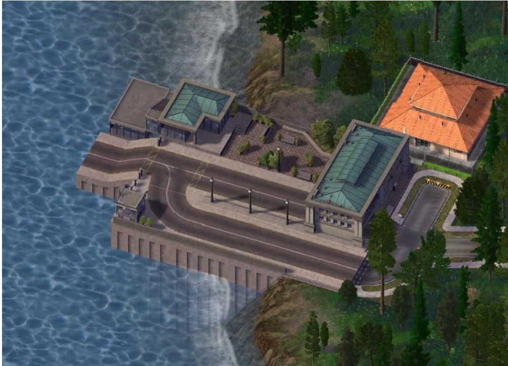
Eastport handles traffic for Tanagiers and all points downriver. The facility is secured by Tactical Response Team members from the 163 rd Regiment, XI Corps – Division 24.