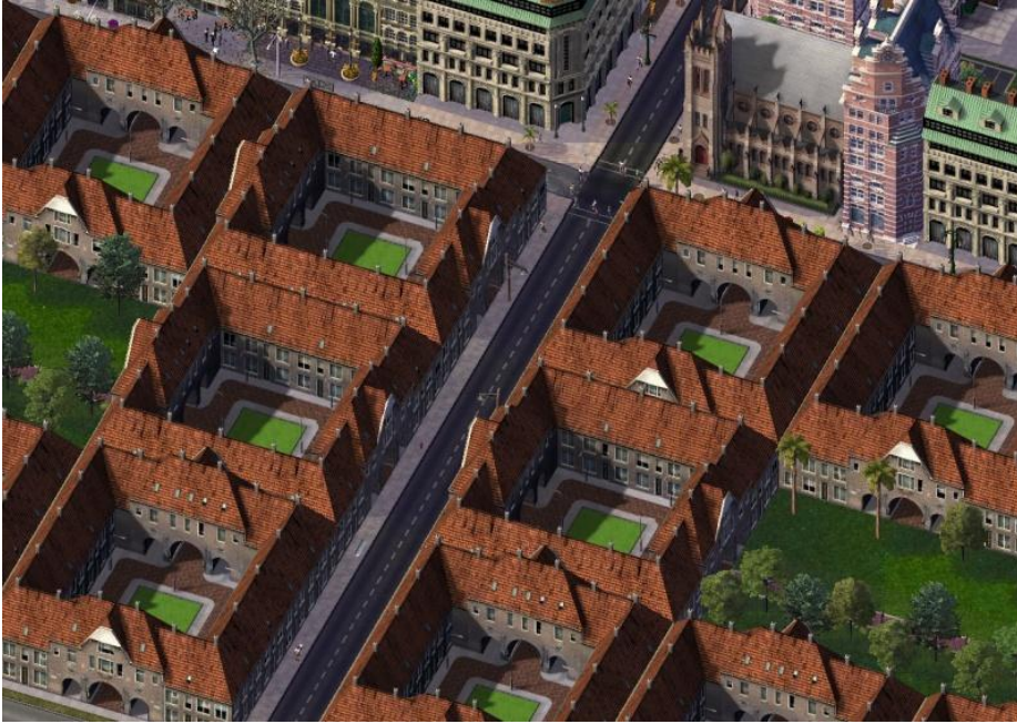
Two quadrangles of barracks have been built, capable of accommodating thousands of air force personnel.