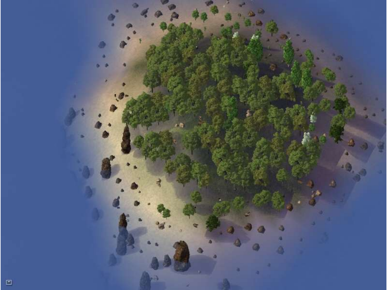
The first island