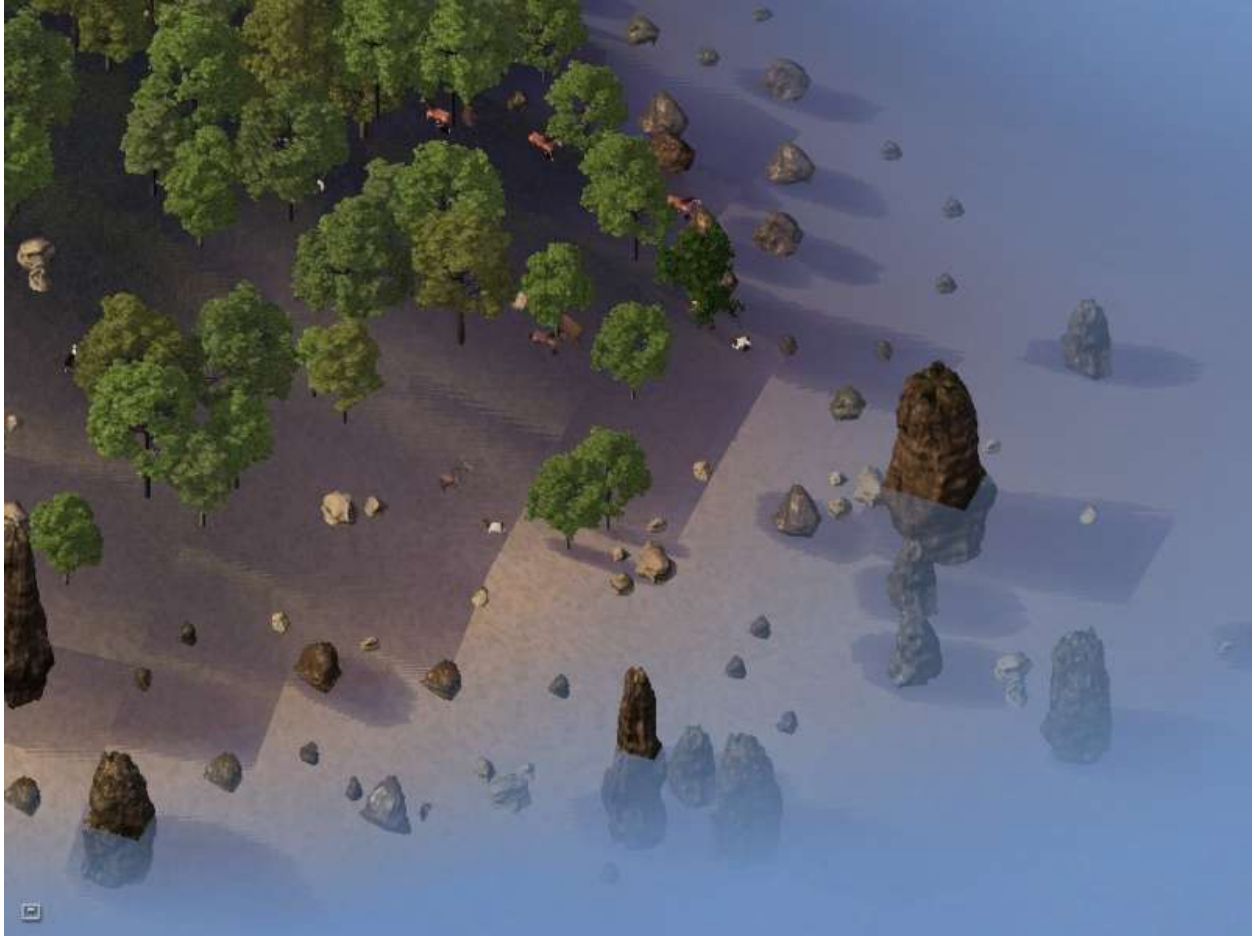
Beach party – succulent animals invited. BYOB BB (the extra B is for Bring Your Own Bar B-Q sauce!).