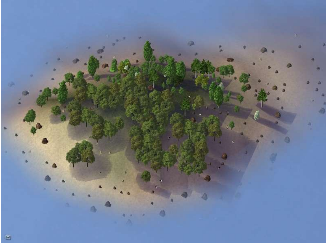
The third island

It was a trifecta of discoveries! The big task now was to name these new lands. The ships all met at sea between the first and second island to debate the naming. All sorts of names were proposed: