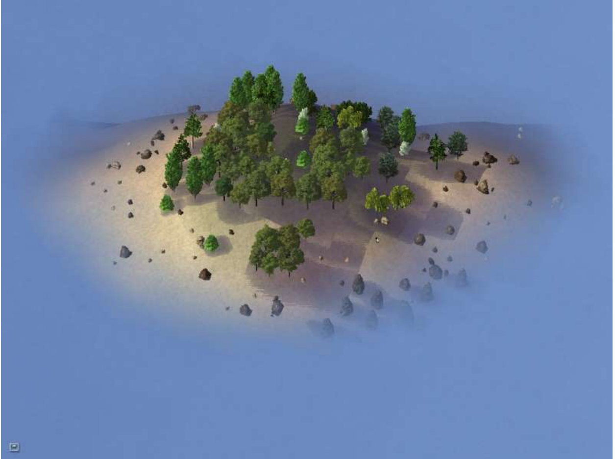
The second island