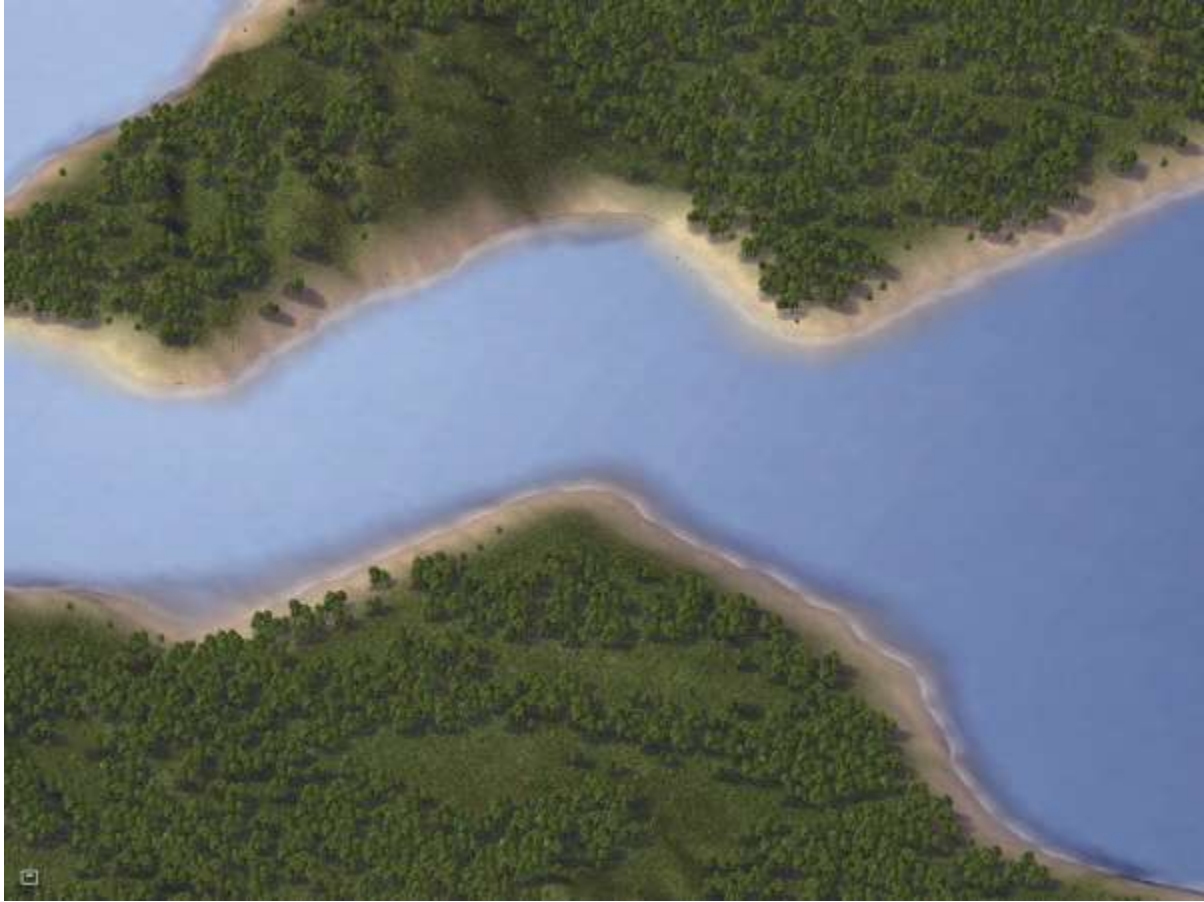
The shoreline discovered south of Atkinos (seen at top of frame)

As the landing party rowed to the shore, they were amazed at the variety of flora and fauna they encountered. As dawn broke, they saw a strange new type of tree never seen on Schulmanicus or any recently discovered island.