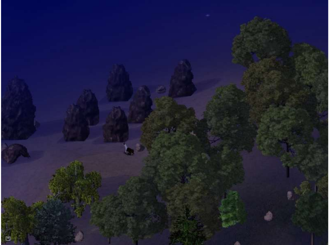
Beach party with the llama. Is there something out there in the distance? Hmmm.....

First thing in the morning, a group would set out to see what laid beyond the islands. What they found surprised them in a way no discovery had up to this point. What they found was a continuous shoreline. This was no island. Or, if it was, it was a big one- far bigger than even Schulmanicus.