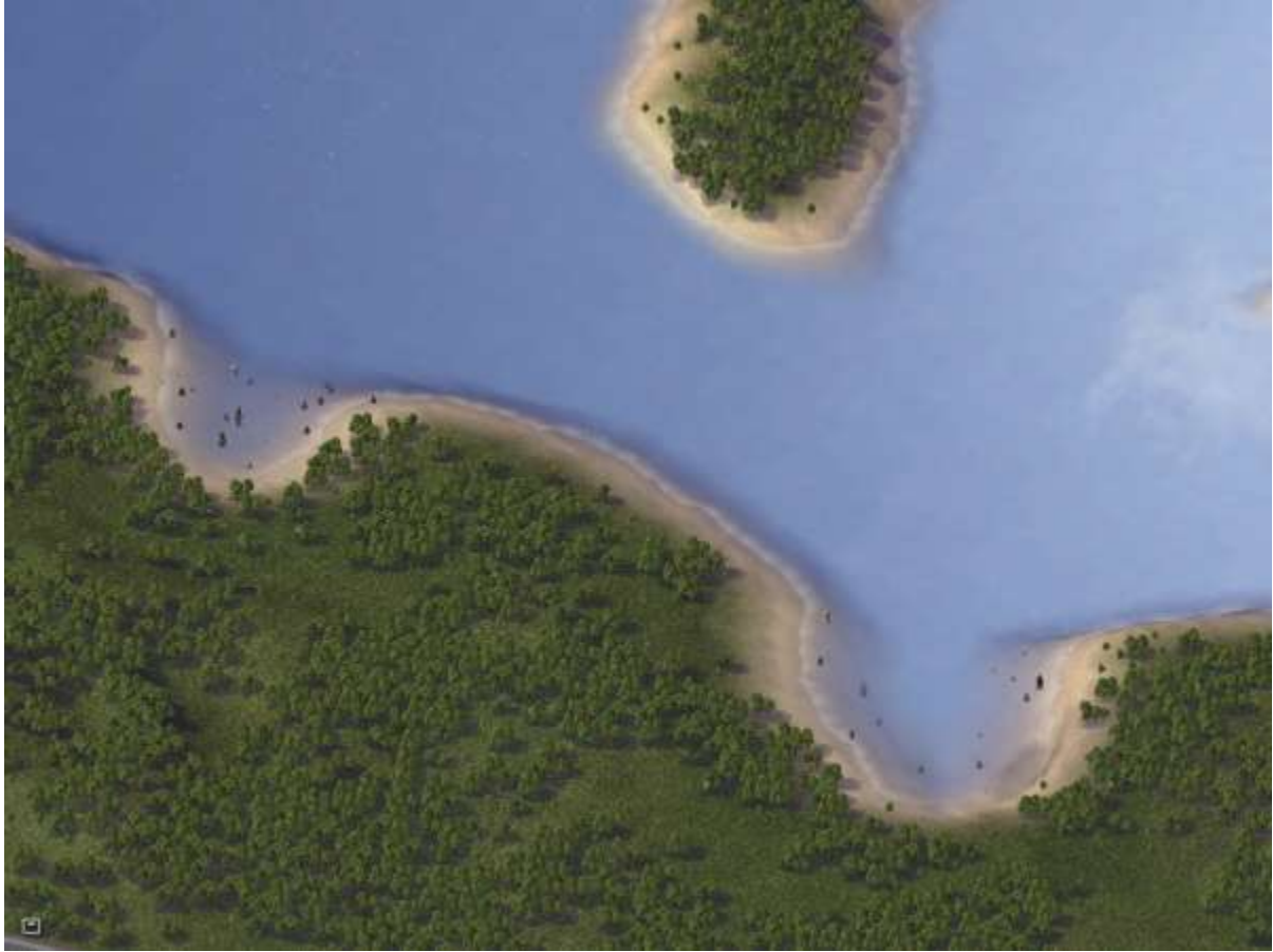
The shoreline discovered south of Gran Maru (seen at the top of the frame)