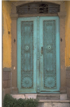
MARKETS OPEN TOMORROW; NORMAL BUSINESS LEVELS EXPECTED

melccia had the day off for Princess Katherine's birthday today, but expect business to remain normal when they re-open tomorrow morning. Relocating the capital from Campo will not make a big impact on local agricultural distributors, analysts report. The demand for agricultural goods will continue to grow, assuring farmers a steady and ever-increasing market for their goods.