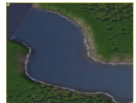
MEANDERING RIVER TO SERVE AS NEW CENTER FOR REGENCY GOV- ERNMENT.

more, well above the 18,000 for Gran Maru, currently the largest in the nation. Determined to have her signature city be a showpiece, Princess Katherine has commissioned a slew of renowned architects to sprinkle impressive masterworks across her new city. The budget for this project is over 13.5 million gold schulmonetas and comes from the regional treasury.