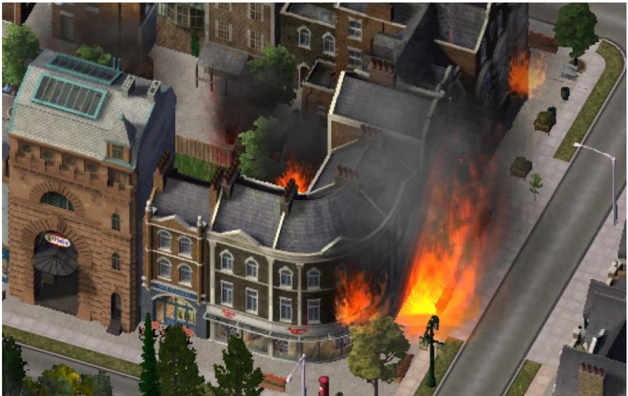
Enemy fire took out Schulminion cannons