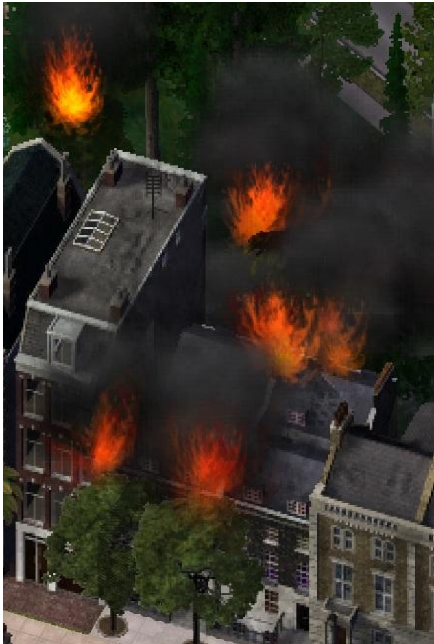
Rowhomes receive rocket and small arms fire