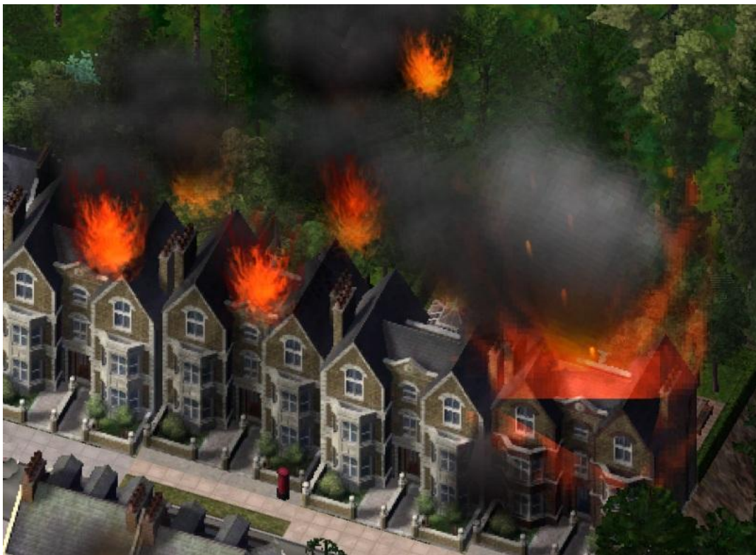
Queensferry is burning the town down