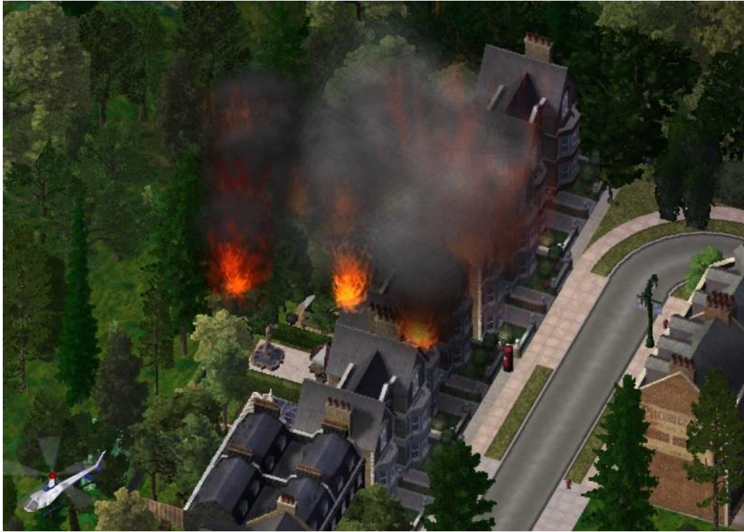
One of the enemy helicopters circles overhead, strafing buildings periodically