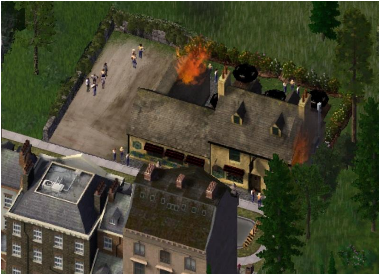
O'Furry's Pub was hit

Meanwhile, an armored column of troops continues its march westward. TRT scouts were surprisingly accurate about the composition of this force: approximately 800 troops, 12 armored vehicles, 4 helicopters, and 20 rocket/grenade launchers. To face them in the evacuated town, three squads of brave members of V Corps armed with muskets and 3 cannons. Their goal: delay the enemy advance to allow for evacuees to move to safety and TRT members to get into position. The fighting begins.