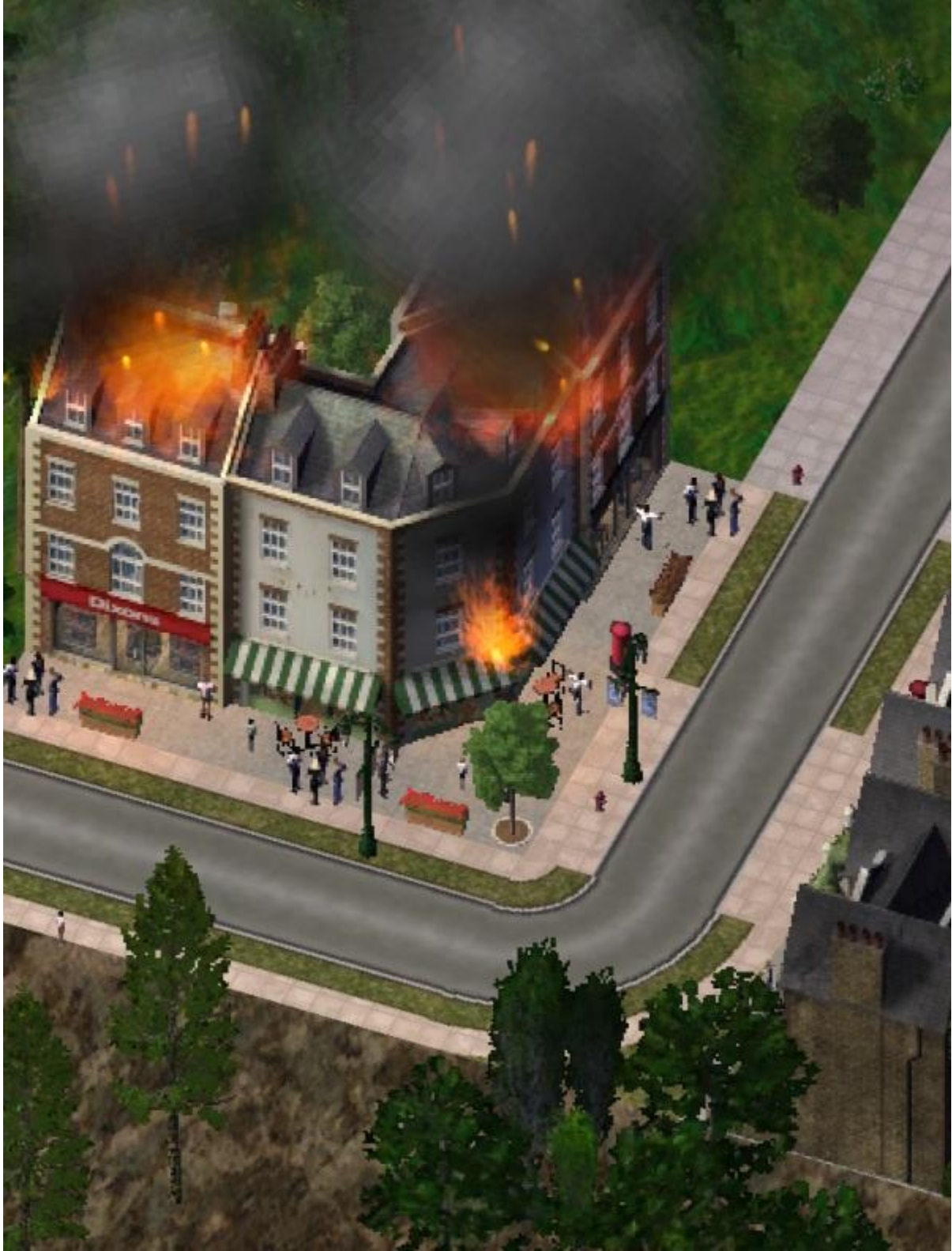
SNA forces prepare to evacuate forward positions