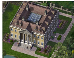
The East Devonshire Government has agreed to fund the expedition

northern Devonshire coast and Woods of Wayne, East Atkinos. There is, as of yet, no way to determine the width of the ocean. Sufficient provisioning and