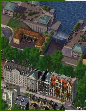
Cape Eastway will be the launching point for the expedition

Woodworkers, shipwrights and blacksmiths across eastern Devonshire and gearing up for the biggest project to hit the area in years. Pending final approval by the Supreme Wurdle, a government subsidy will underwrite the creation of an eastern fleet of exploration to be headquartered out of Cape Eastway.