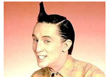
Cult Leader Llama Larry runs his Oras commune on the Isle of Scout

ports. There has been no passenger traffic to or from Oras and there are no scheduled passenger ferry routes to the commune. Llama Larry maintains his small wooden ship in his port should the need arise for transit or trade.