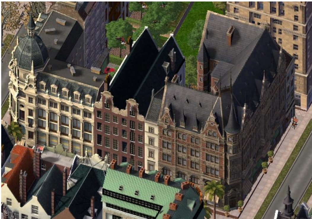
Higher-end merchandise can be found on Simon Sidney Street. Boutiques such as The Catnippery and The Leftorium vie for shoppers' schulmonetas with emporia like Mahuyide's Coin Shop and the Mythbuster DIY Store.