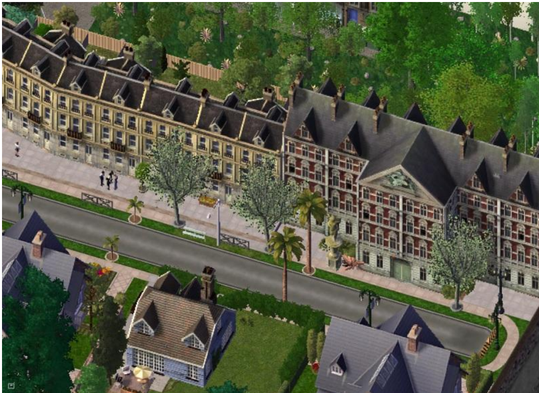
The Ducal Bank of East Atkinos also houses the Nikonian mint