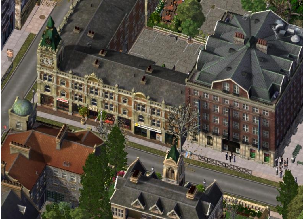
Commerce abounds in Nikonia. Stores in Candles Corners do well, as do the small businesses located next door in the Cecil Office Building.