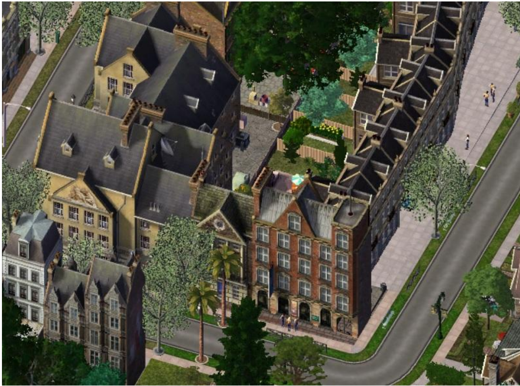
One unusual store is Maris' House of Sensory Deprivation and Ocelot Accessories