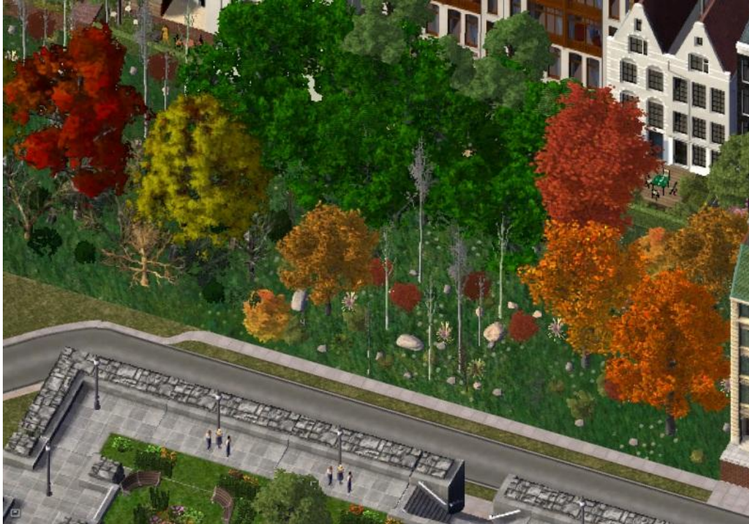
Clandestine Park is the centerpiece of town. I'll bet you would never know there's over 1000 muskets and over 50 cannon stored inside there if I did not tell you.