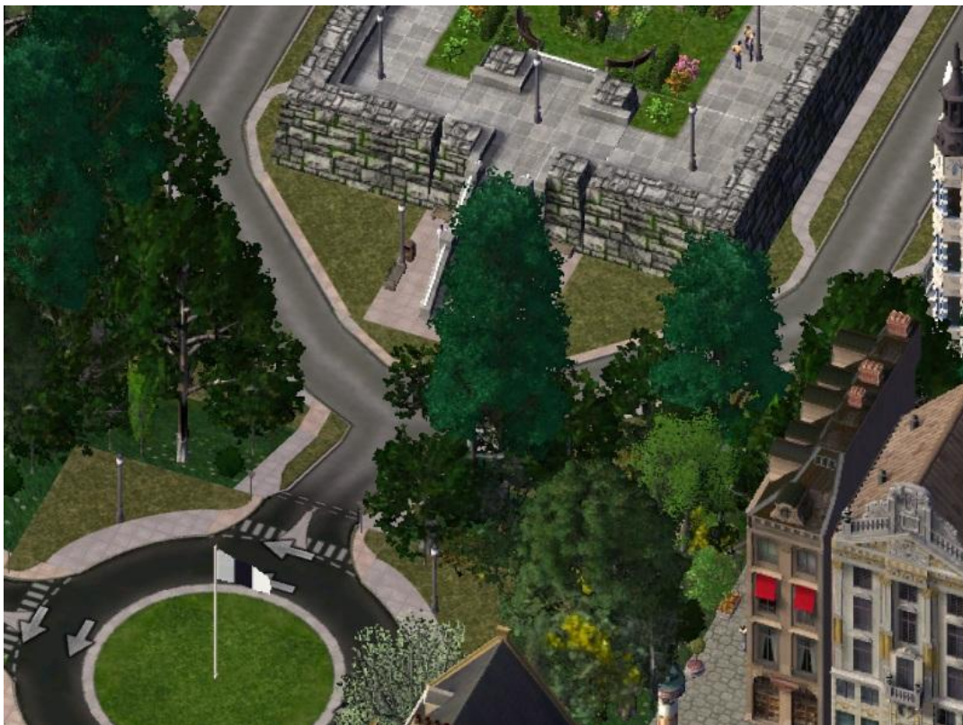
The entrance is right under that staircase. Do you see i