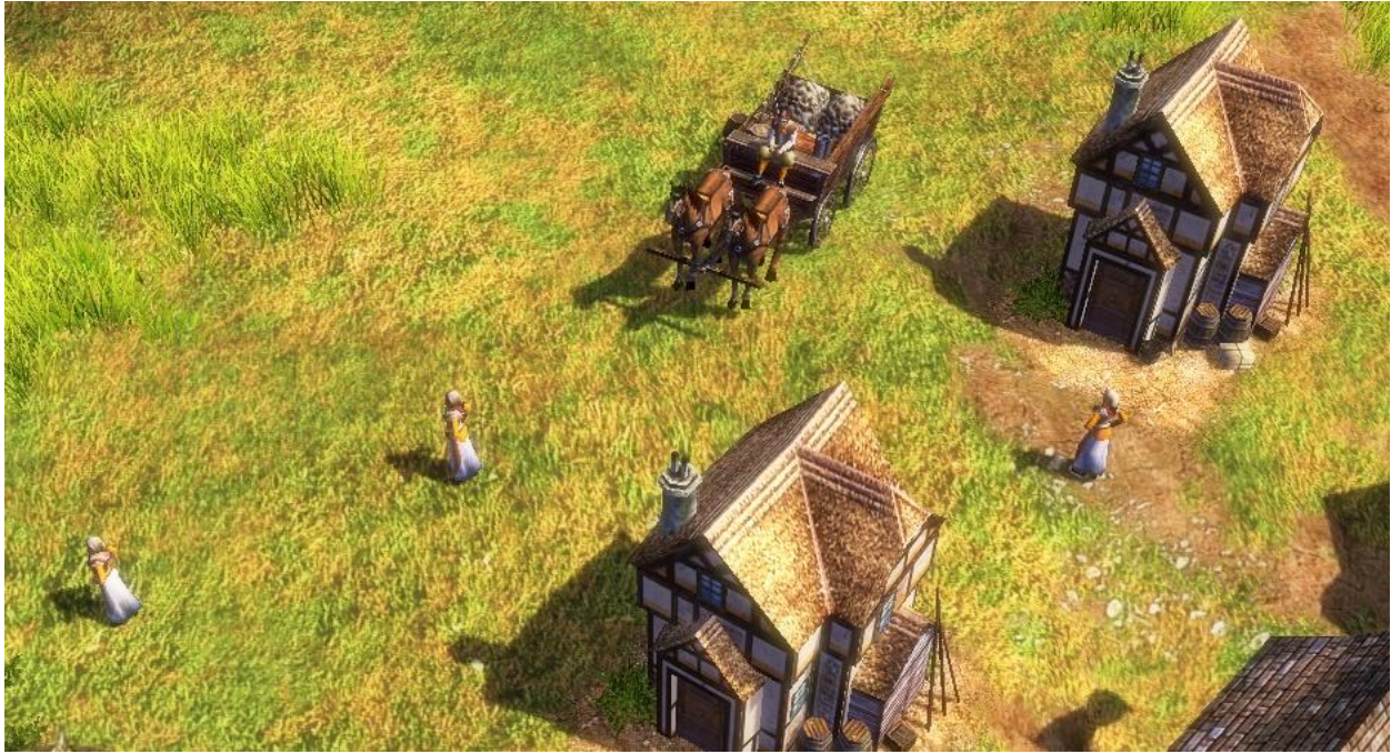
Sergeant Johnny Rico is bringing another load of newly designed weapons to the southern end of the encampment.