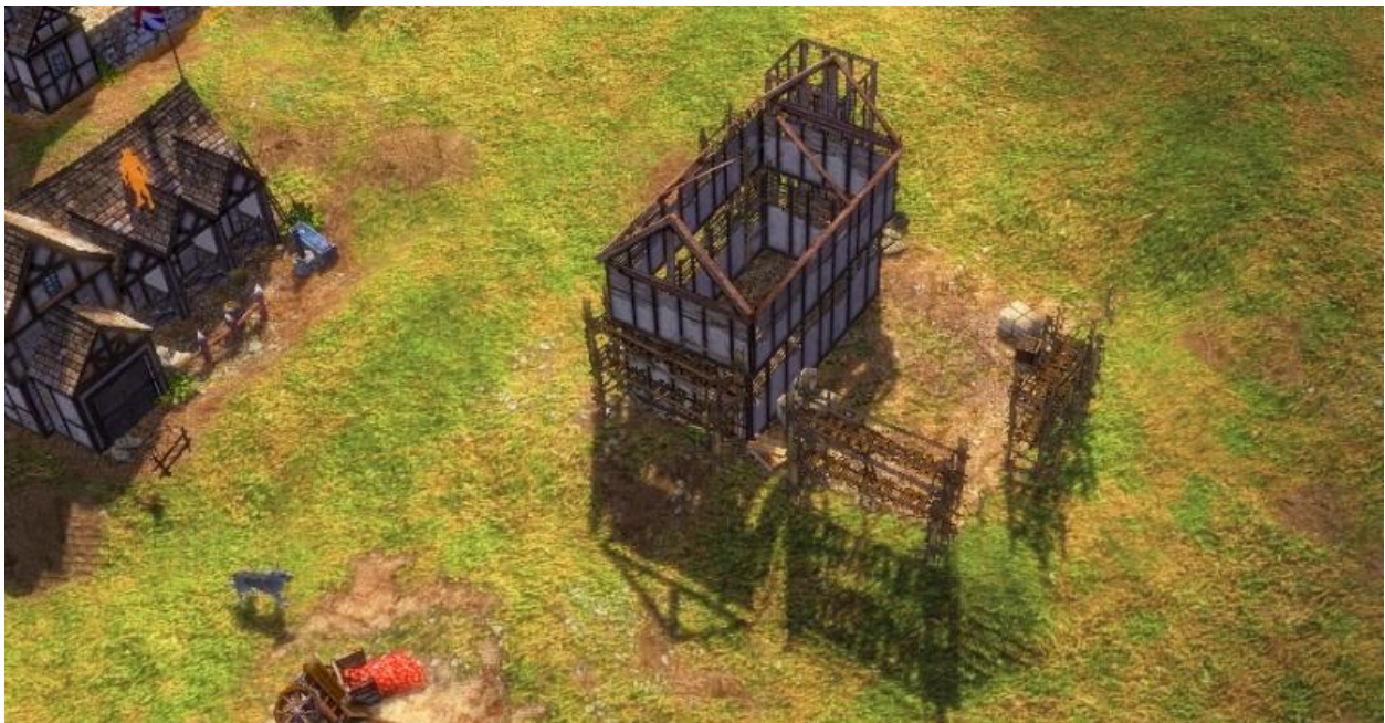
Additional military buildings are being constructed as well as the foundations being laid for stone walls.