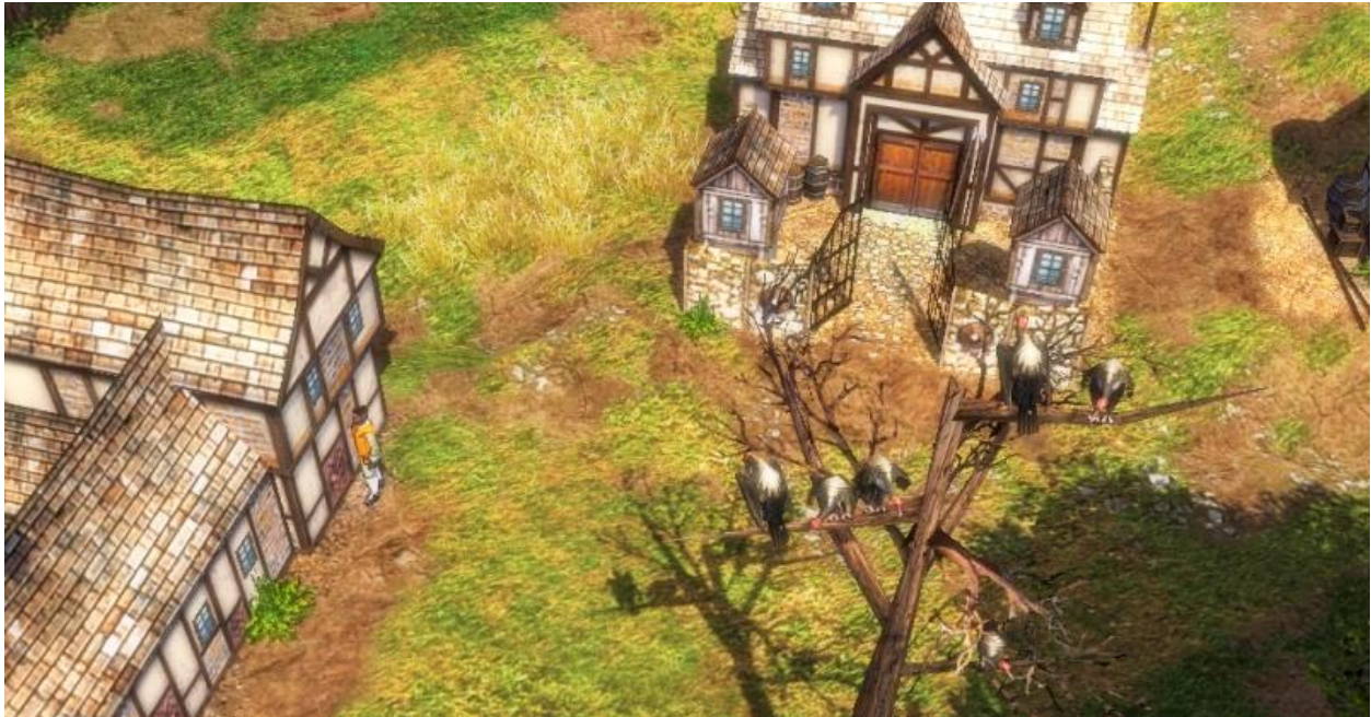
Outside Mercaptan, vultures survey the encampment. Could this be an omen?

The V Corps, designated to patrol the Devonian Mountains, have moved east and set up defensive outposts along the rolling hills proximate to Mercaptan and Liver Springs. Engineers have arrived to build fortifications and defensive walls, though it will be some time before that project reaches completion.