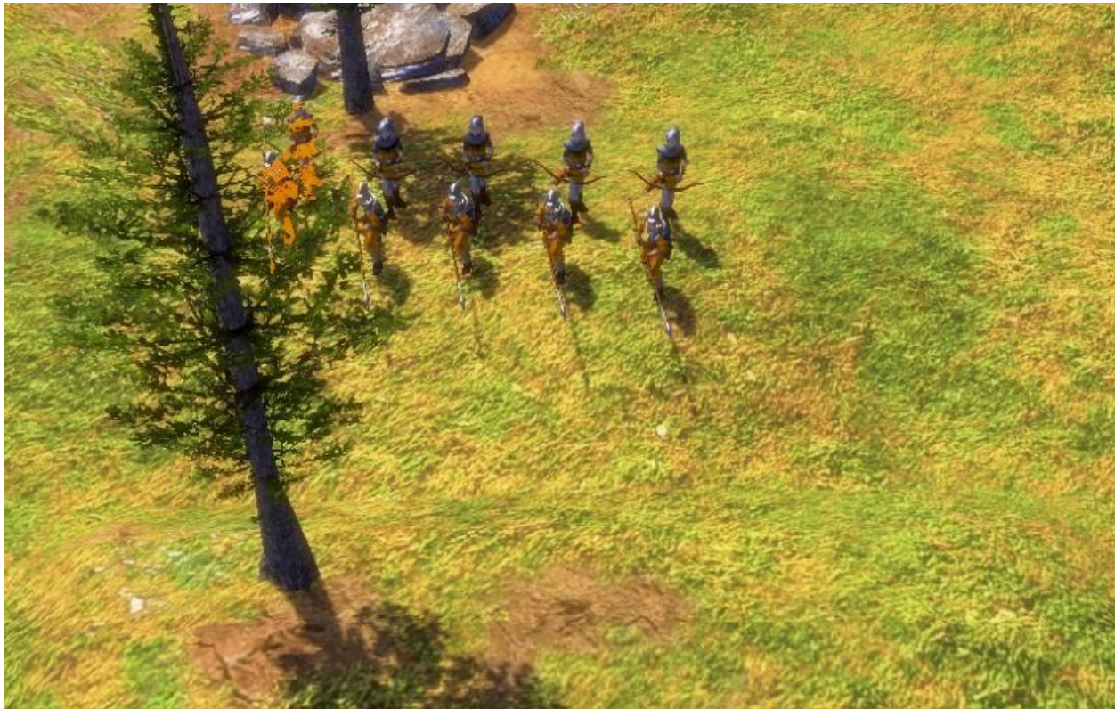
The development of the bow and arrow has greatly improved our defensive capabilities. Soon, every regiment will have at least one brigade of archers.