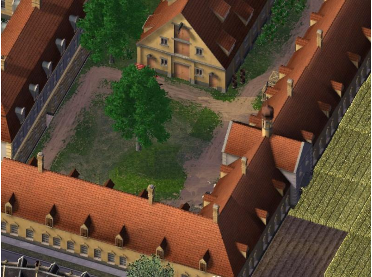
The comfortable confines of my gardens allow me the opportunity to play and practice my hunting skills.