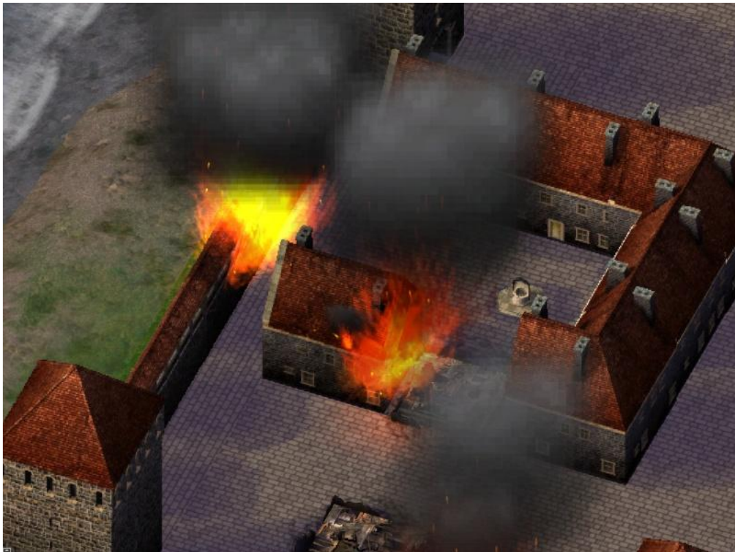
The complex is being evacuated before it's too late...