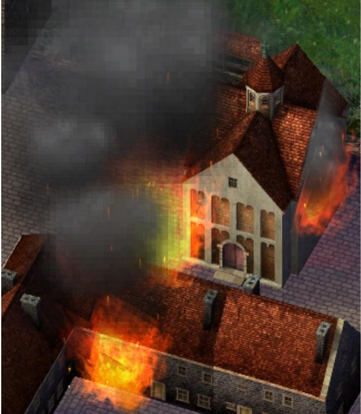
There would be no sanctuary from the repeated bombings and the strafing runs by the Bugg-13 escort planes.