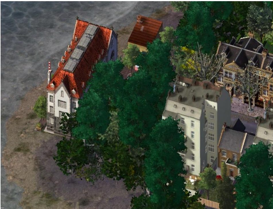
The town and the coast are protected by Fort Claw, on the southern end of the island.