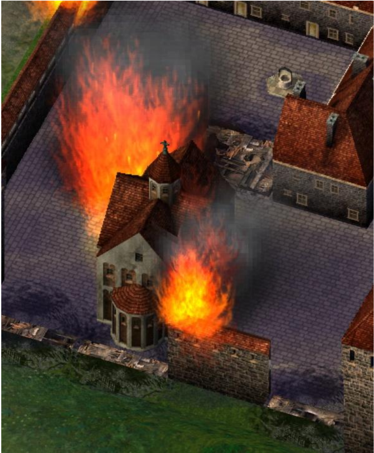
As the bombs start raining down, the venerable stone fort quickly goes up in flames.