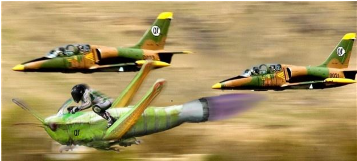
Here comes the bomber with 2 escort fighters...