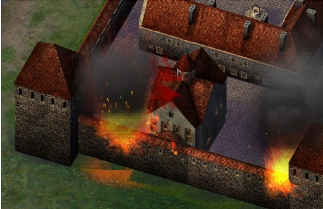
I just noticed that the drill formation lines have burned off the ground.