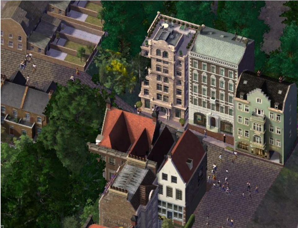
The town of Hammers sits on the northern tip of Pellissippi Island, just off the Tenne mainland.