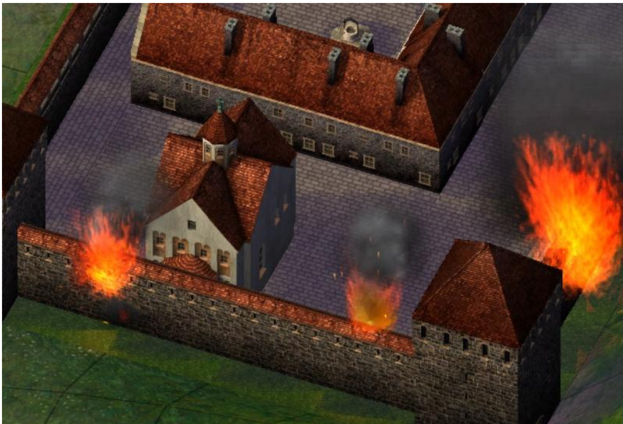
Incendiary bombs are being dropped indiscriminately along the length of the island. (I have to wonder why they painted lines on the ground outside the fort... was it for drill formations? Anywho, at least it's not a bulls eye.)