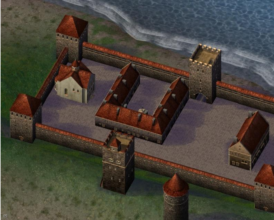
Fort Claw is the key to northwestern defenses.

Of course the town and the fort do not have any idea that they have just been targeted for attack. Nor should they suspect anything, being so far from the war zone. But, distance may not prove a suitable barrier to attack.