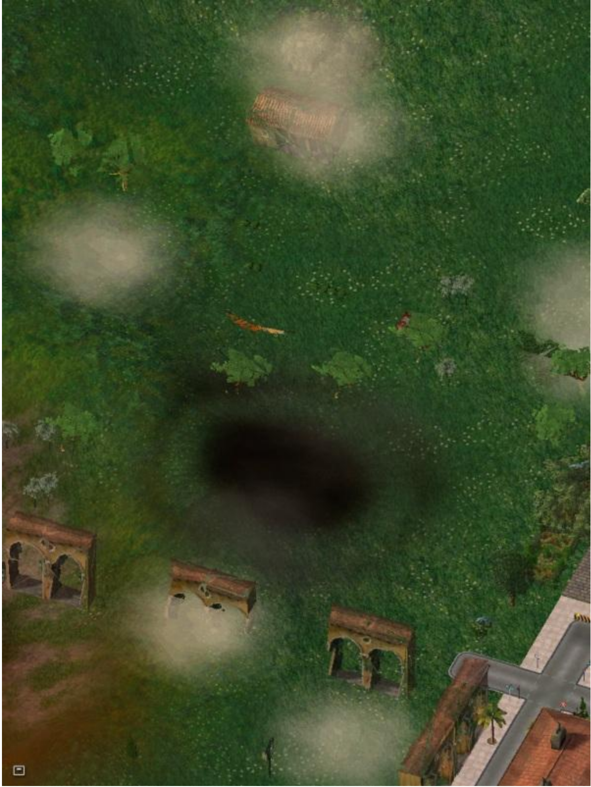
The destruction was complete in Atkinos Crossroads...